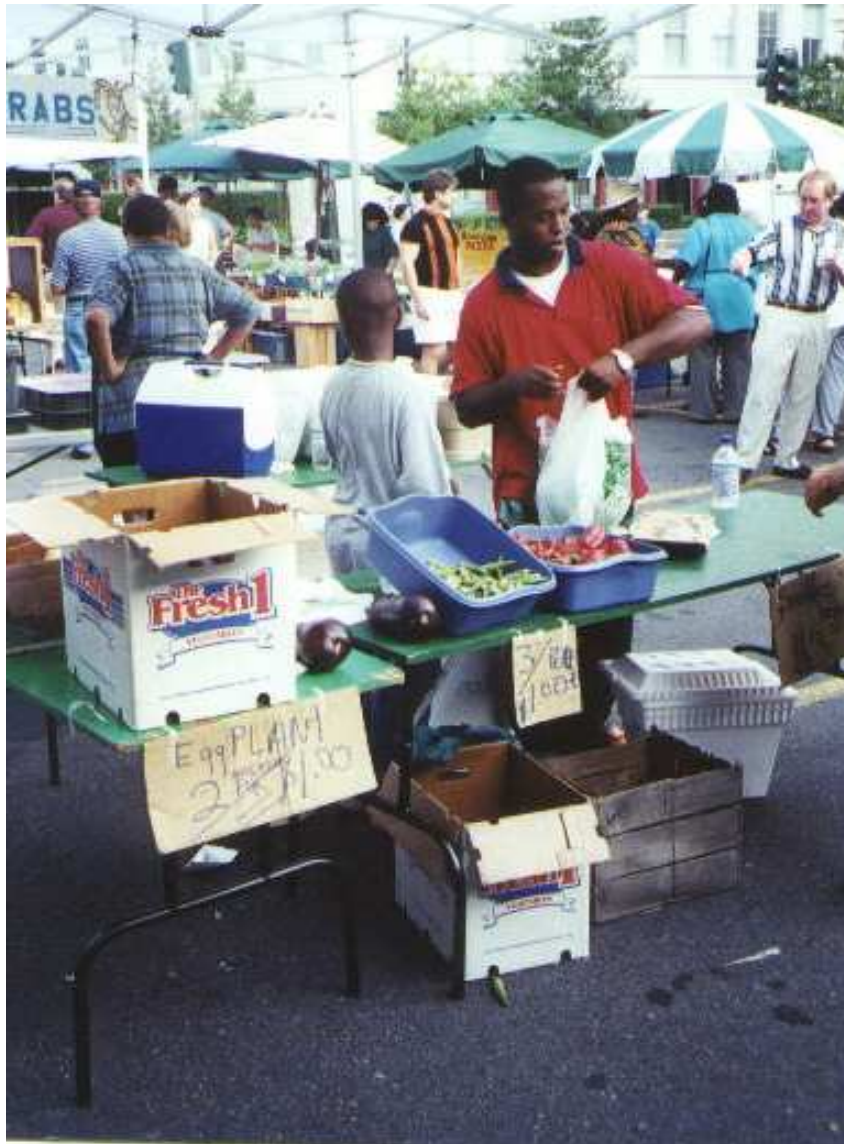
Crescent City Farmers Market. (New Orleans, Louisiana).