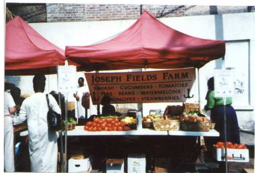
Charleston Farmers Market. (South Carolina).